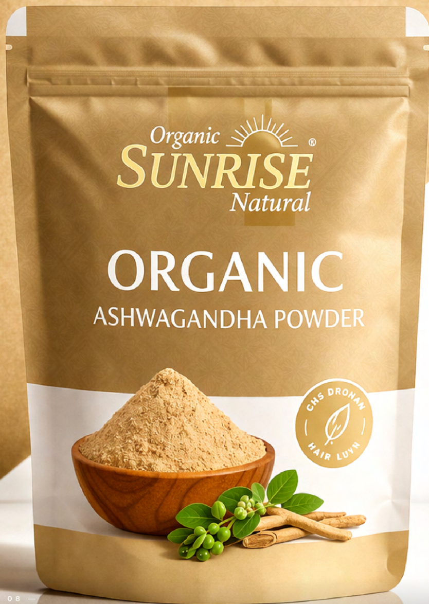
— 02 OF 08 — Ashwagandha Powder Rejuvenating Adaptogen